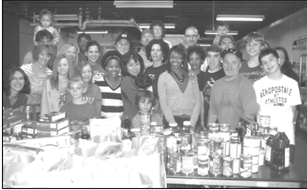
M*Modal Family Volunteer Day