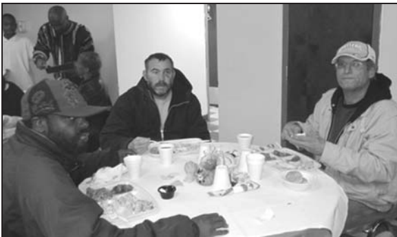
Thanksgiving Day guests at Rainbow Kitchen