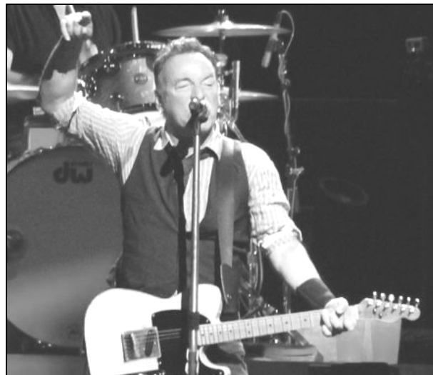
Bruce Springsteen, Consol Energy Center