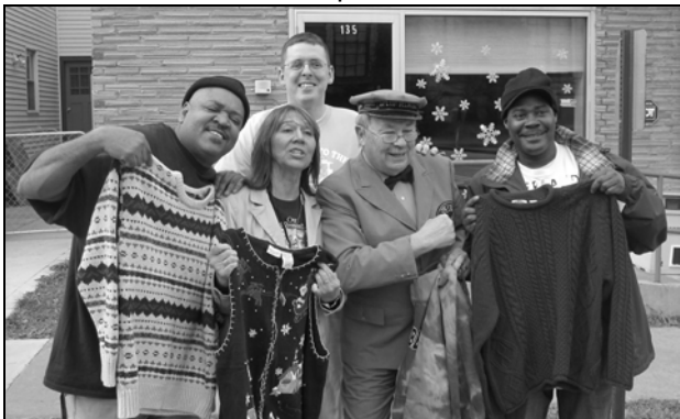
Thanks to Briarcliff Pavilion Health & Rehabilitation Center employees who contributed to the Mister Rogers Neighborhood Sweater Drive - and joined Mr. McFeely in making a Speedy Delivery of sweaters to Rainbow Kitchen!

You can also help by volunteering, conducting a food drive, or collecting non-food essentials such as paper products, toiletries and diapers, which cannot be purchased with food stamps, making it difficult for low-income families to acquire these necessities.