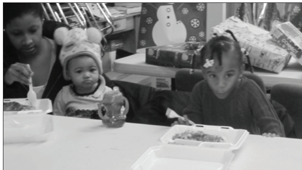
Children enjoying a Kids Café meal during the holidays

$1200 will sponsor a hungry low-income child in our Kids Café program for a full year