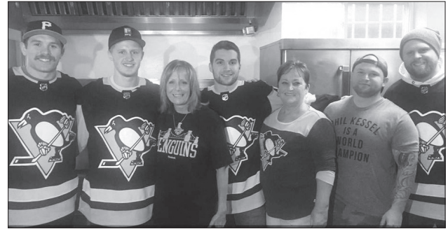
Pittsburgh Penguins with Rainbow Kitchen Staff & Volunteers