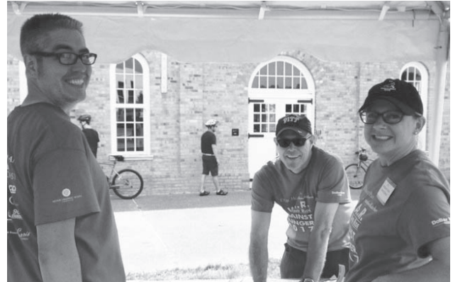
2017 W.A.R. Against Hunger registration