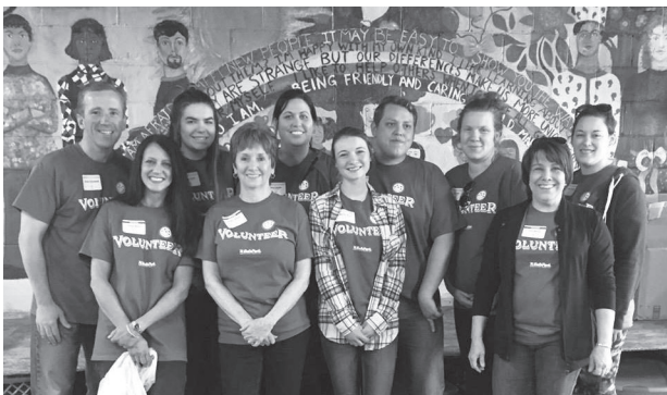
Eat'n Park Day of Smiles volunteers helping out in our Food Pantry